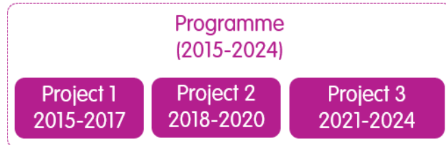
Figure 3. Arrangement of projects within programme.

This document outlines the Project plan for the ongoing Project 2 (2018-2020 inclusive) (Figure 3).